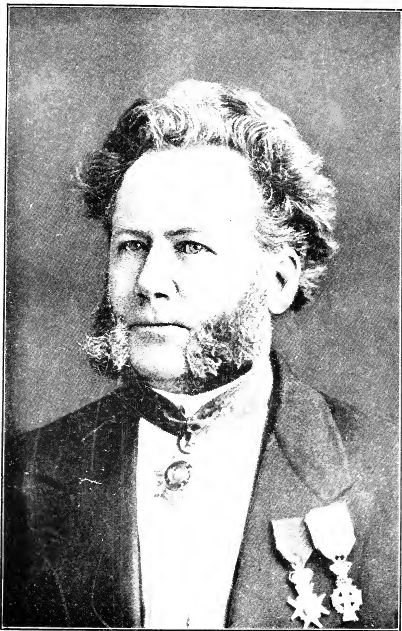
Ibsen in Dresden, October, 1873.